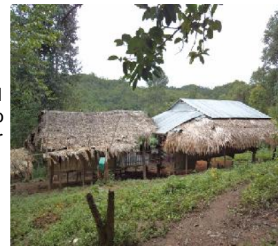
(Above) Kew Mai Sang Village (Below) a village family